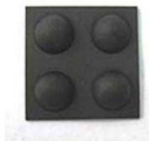
1. Rubber Feet (4pcs/sheet)