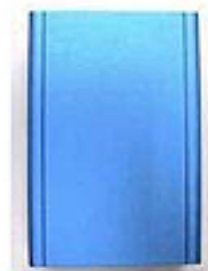
2. Extruded body