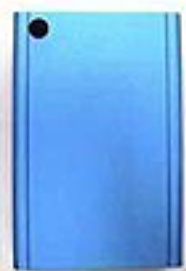
3. Per the photo, Affix the rubber feet in the extruded body.